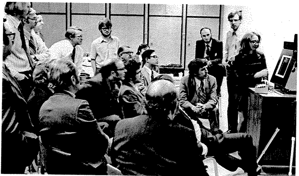
This computer-based information system called PLATO is being studied as a possible means of giving citizens free access to data about their community issues and involving them in community planning.

Citizen concerns need leadership and a program of action before they can be of benefit to the community. Understanding how to successfully develop leaders and action programs becomes a vital element of citizen involvement research.