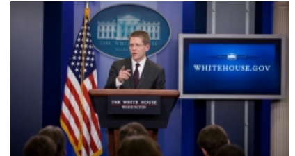
May 03, 2011 4:32 PM