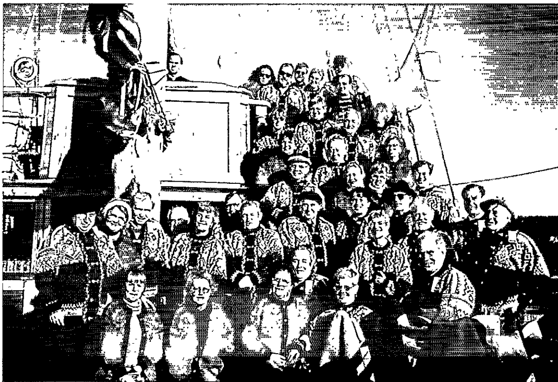
The symposium at sea.