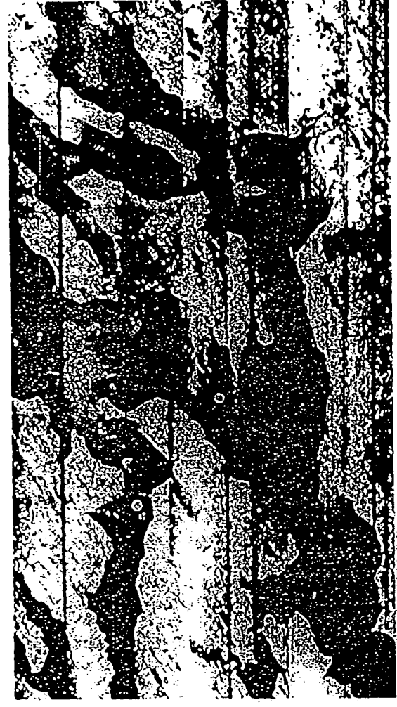
Cosmos-1870 Synthetic Aperture Radar and Imagery Characteristics Antennas