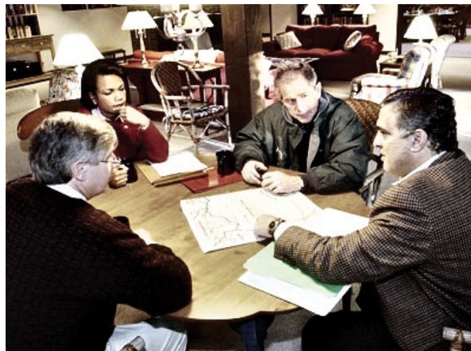
Photo: Post-9/11 meeting at Camp David – President George W. Bush, National Security Advisor Condoleezza Rice, Chief of Staff Andrew Card, DCI George Tenet

Tasked with providing information and assistance to policymakers, starting with the President, DI analysts cover issues worldwide, from politics to economics, and personalities to technology and terrorism. CIA's analytic ranks are filled with critical thinkers trained to sift and test information from all sources.