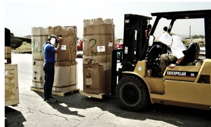
Photo: Loading supplies Previous page: Loading equipment onto C-17 transport plane for shipment

When they landed, the team had three days to build the first warehouse. For security reasons, they worked only during daylight. They got the job done on schedule and finished construction of a second warehouse, completing both jobs a week after the officers had arrived.