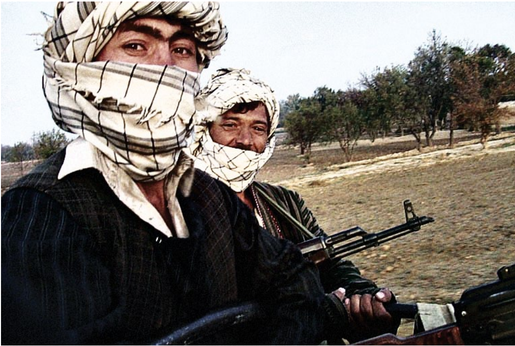
Photo: Afghan fighters