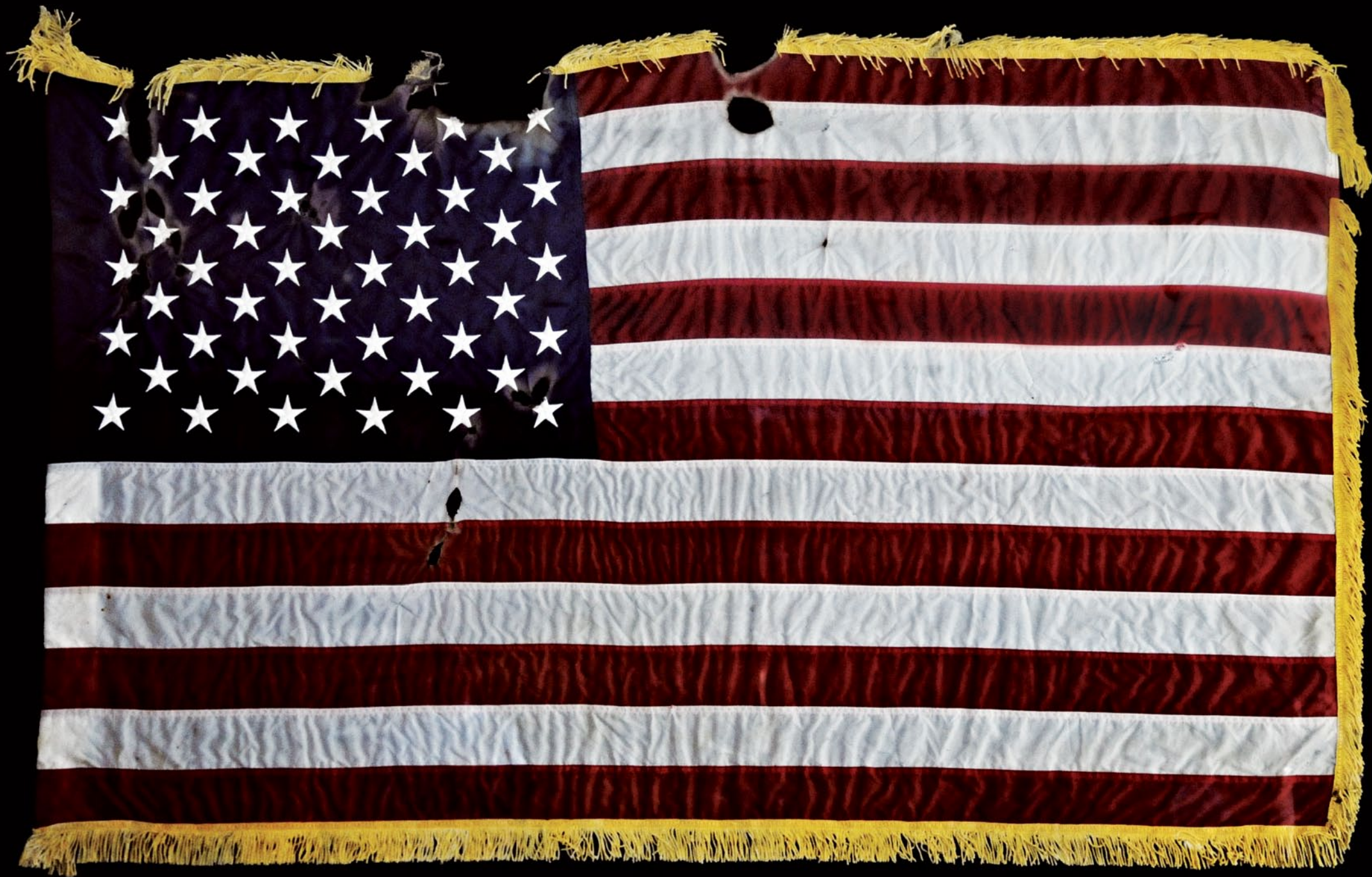
This scorched and tattered flag, recovered from the debris of Ground Zero, hangs in the Office of the Director of CIA. It is a constant reminder of the strength and durability of the nation we serve.