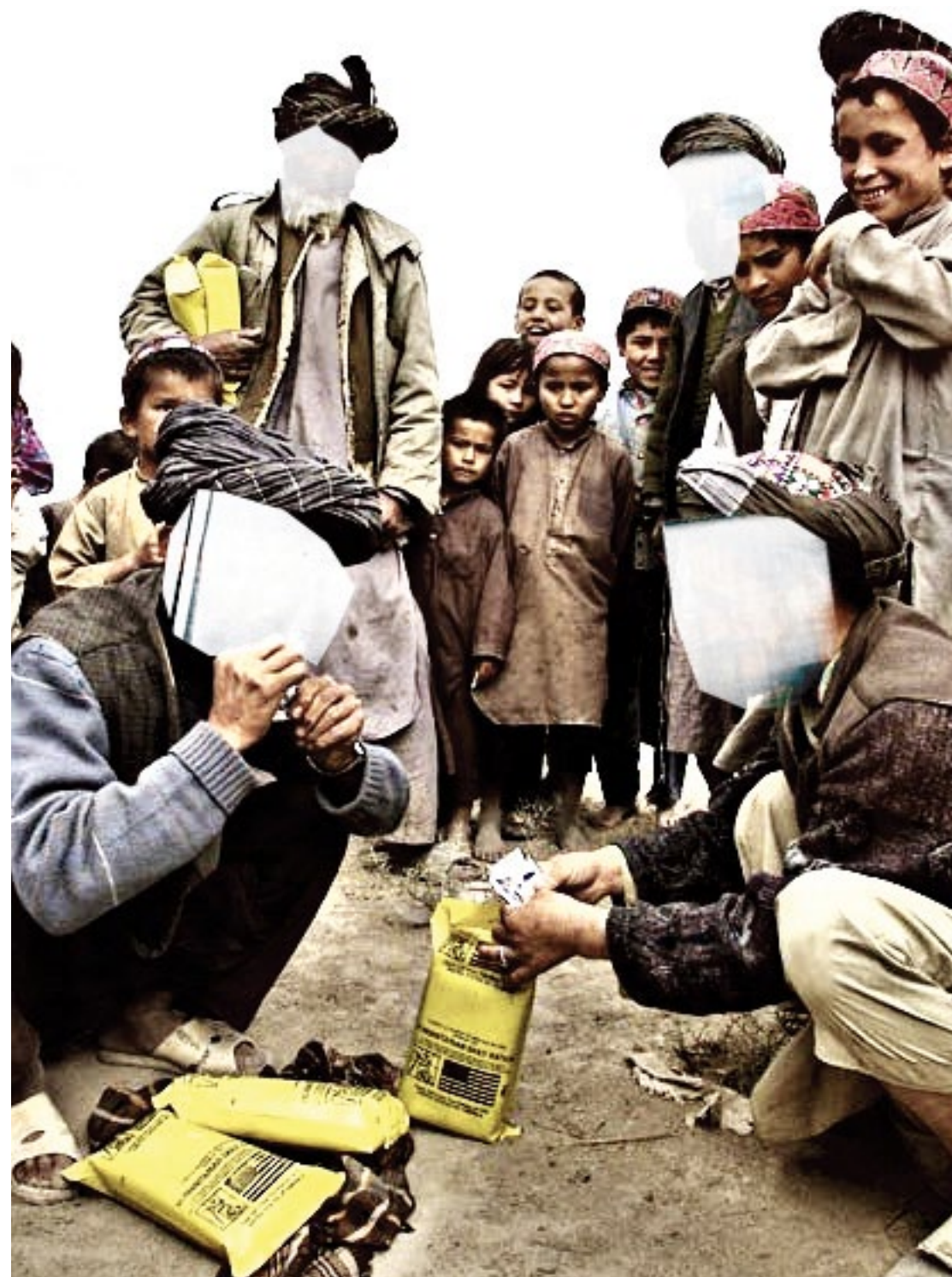
Top photo: Afghanistan landscape Right photo: Food supplies from the US Government

A week after the attack, Director George Tenet told senior Agency managers, “There can be no bureaucratic impediments to success. All the rules have changed...We do not have time to hold meetings to fix problems—fix them—quickly and smartly. Each person must assume an unprecedented degree of personal responsibility.”