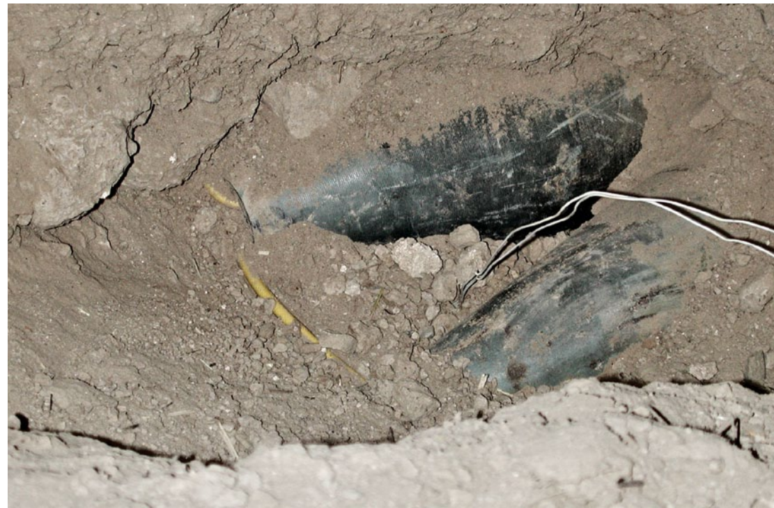
Photo: Mine probing tool and explosives

Scientists, engineers, model makers, and artists are just some of the specialists who serve in the Directorate of Science and Technology. The DS&T deployed its technical expertise after the September 11 th attacks to support CIA officers in the field.