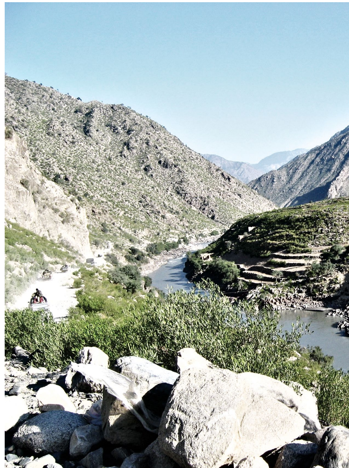
Photo: Afghanistan landscape

These are only a fraction of the stories we are able to share with the public. Many others must remain secret.