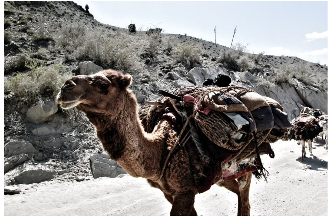
Photo: Local transport in Afghanistan

Through Pakistan, CIA provided the mujahidin with money, weapons, medical supplies, and communications equipment. Initially the goal was to drain Soviet resources by keeping their forces bogged down. In 1985, CIA shifted from a plan of attrition to one that would help the rebels win. One of the pivotal moments came in September 1986, when the mujahidin used CIA-provided Stinger missiles to