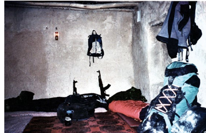
This page: NALT’s sleeping conditions

Small and highly agile paramilitary mobile teams followed the first NALT, spreading out over the countryside during the day to meet with locals and gather information about the Taliban and al-Qa’ida. In the evenings, they slept outside of town. During that time, one of the teams was approached in a village and asked by a young man for help in retrieving his teenage sister. He explained that a senior Taliban official had taken her as a wife and had sharply restricted the time she could spend with her family. The team gave the man