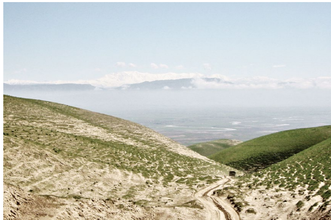
Photos: Challenging Afghanistan terrain

Afghanistan is a rugged, beautiful country, from the snow-capped Hindu Kush and the green mountain valleys to the stark landscape of the northern and southern plains. It is home to a tapestry of peoples and cultures, whose histories are those of the ancient powers of the East, from the Median, Persian, Gupta, and Mongol empires. Trade routes from across the ancient world traversed its passes, giving rise to trading centers such as Herat, Kandahar, and Kabul.