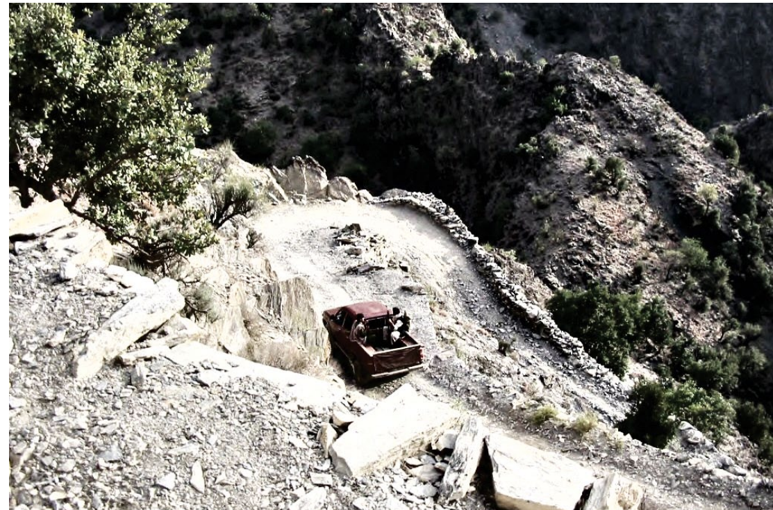
Top right: View of Afghanistan mountain range from Mi-17 helicopter Lower right: Road conditions in Afghanistan