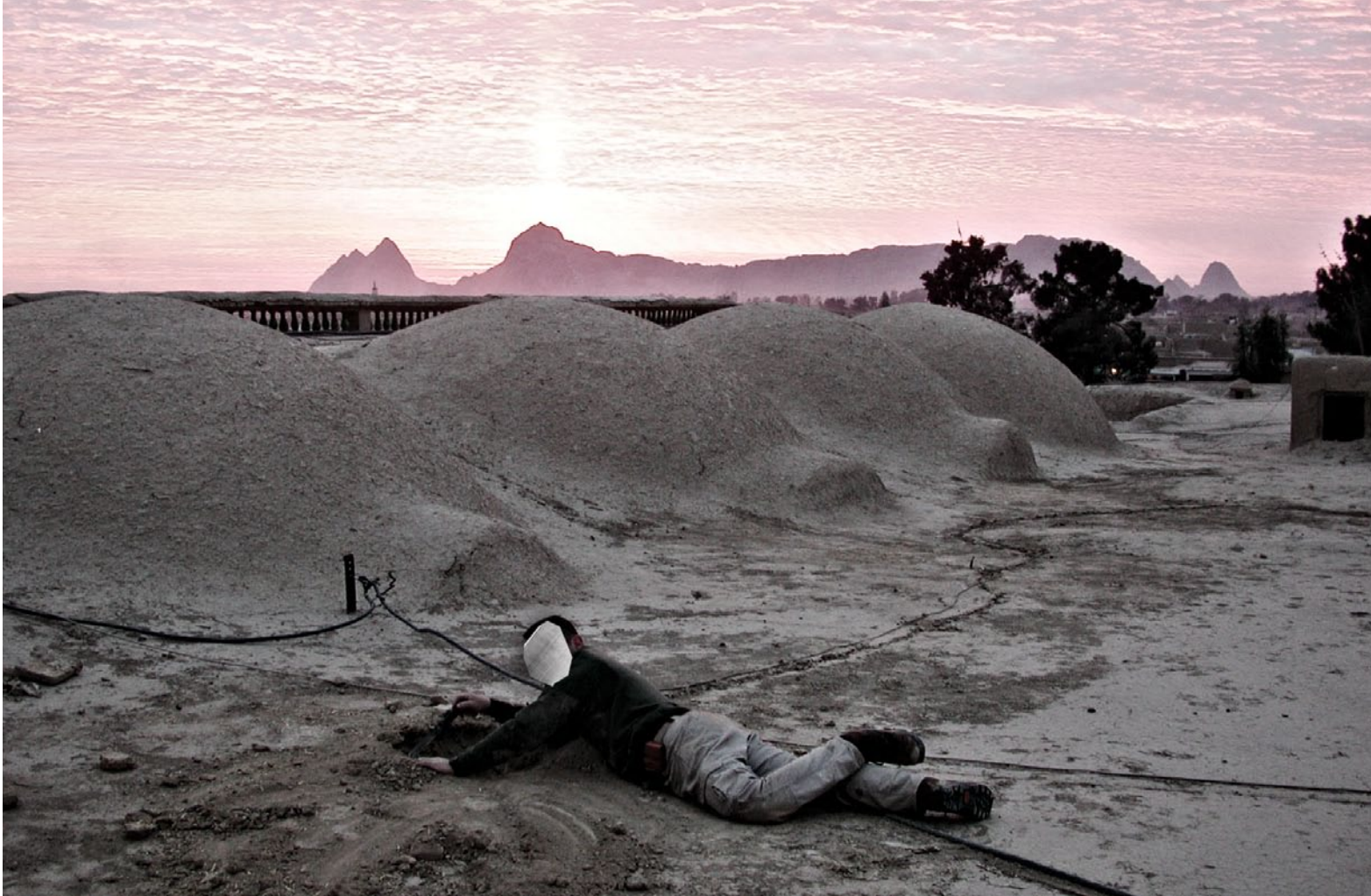
Photo: Member of CIA Explosives Ordnance Team using mine probing tool to find dozens of mines, artillery shells and other explosive devices

in the courtyard saying he had heard that a bomb was hidden in the base compound, in the Palace building right next door, and that it was set to detonate at sunset to mark the end of Ramadan.