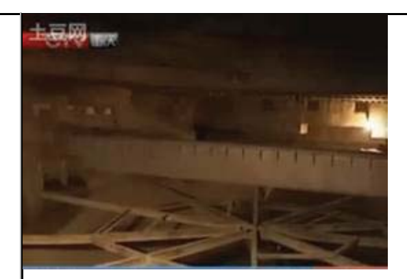
Shot of nuclear reaction cauldron

CQTV reporter Cai Qiang: "I am now at one of the 19 caves of Project 816. The entrance of it measures nearly 7 meters in width and 12 to 13 meters in height. I can feel that the ventilation is very good because the wind keeps blowing outward from inside the cave. The temperature here is kept at 25 degrees in all seasons. That is why although it is very hot outside, I see my breath as I speak here. A builder of the site told me that the tour would take one hour. Let's go and have a good look."