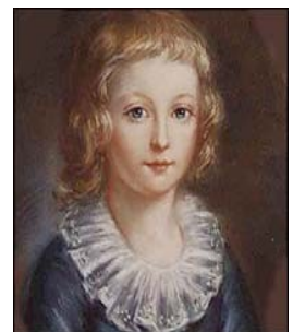
10-year-old Louis Charles, the Dauphin of France

“Eventually over one hundred people claimed to be or were thought to be the Lost Dauphin.”