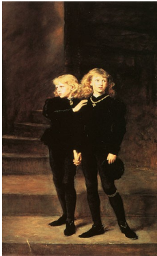
The Princes in the Tower