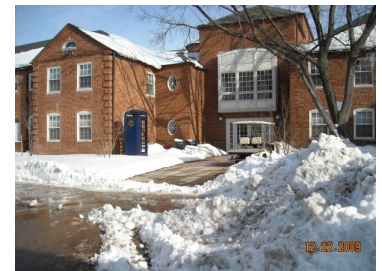
The Big Snowstorm of 2009 Somers Hall

The Department added 66 new degree candidates in the fall 2009 semester.