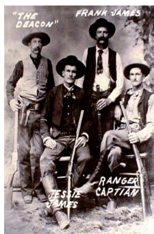
The Jesse James Group

“Here lies Kaspar Hauser, riddle of his time. His birth was unknown, his death mysterious.”