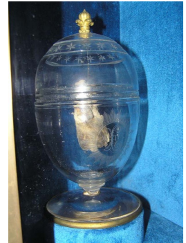
Believed to be the heart of Louis the XVII

In 1828, a strange young man appeared on the streets of Nuremberg. He could barely walk and barely talk. He could however write his name: Kaspar Hauser. He told a strange tale of having been raised in a darkened cellar. Quickly Hauser became an international celebrity. Conjectures were offered up as to his origins, one being that he was the hereditary Prince of Baden. Hauser, it was asserted, was the son of Duke Karl von Baden and Stephanie de Beauharnais (daughter of Napoleon's empress Josephine de Beauharnais). Officially, the son of Duke Karl and Stephanie de Beauharnais had died less than a month after his birth in 1812. According to the Prince of Baden theory, the legitimate offspring (Kaspar Hauser) had been switched for a dying infant in order to direct the succession to another branch of the family. The mystery surrounding Hauser was deepened by an accidental (or intentional) gunshot wound. Then in 1833, Hauser died of a stab wound to his chest. As he lay dying he told of being lured into a garden by a stranger who then