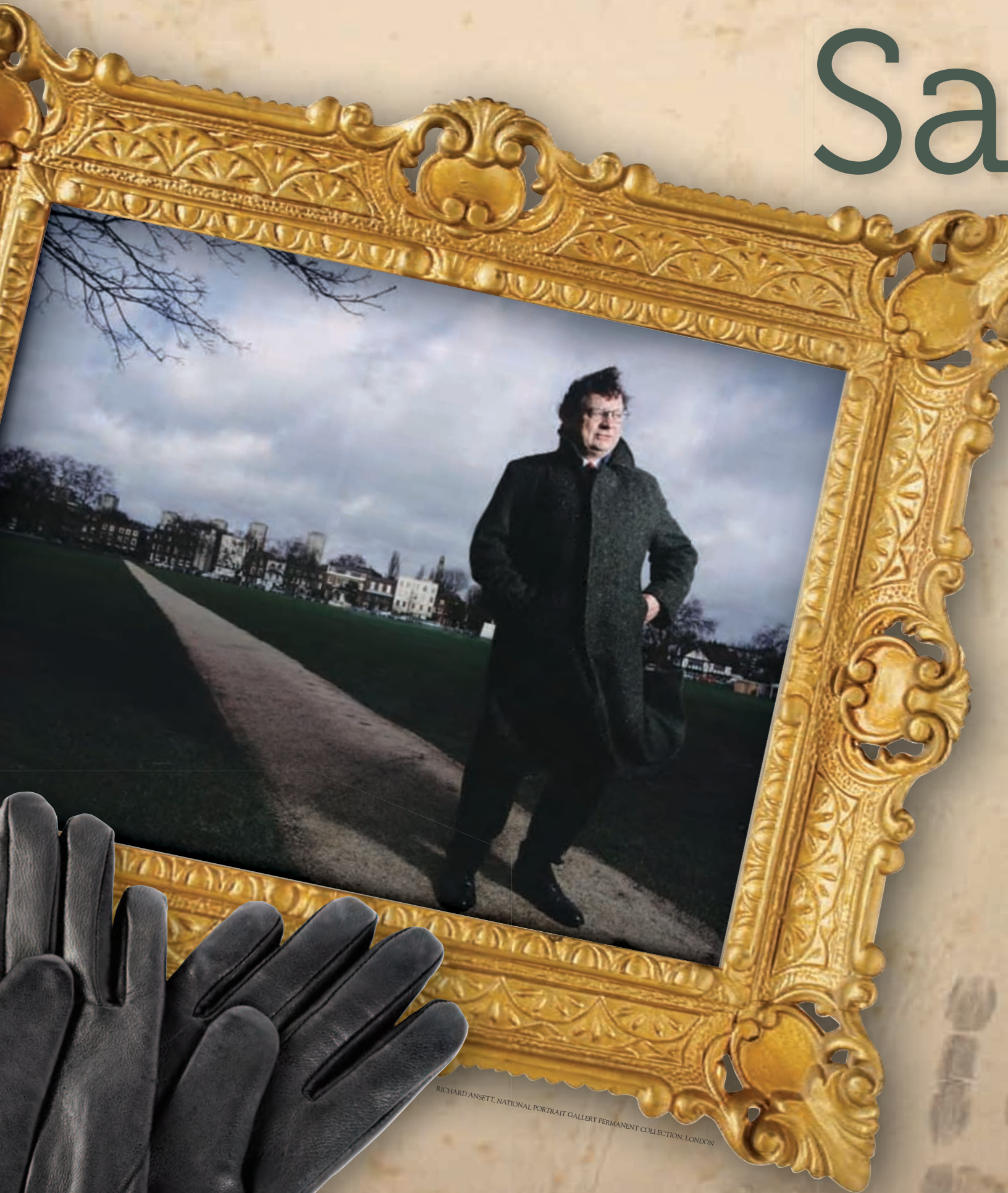
RICHARD ANSETT, NATIONAL PORTRAIT GALLERY PERMANENT COLLECTION, LONDON