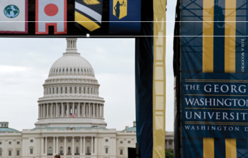
The U.S. Capitol provided the backdrop for Commencement 2010. GW is the only university in the country to hold commencement on the National Mall—a tradition extending back to 1992.

“Eight months ago...I promised that if you performed 100,000 hours of service for the greater Washington community this school year, that I’d come and speak at your commencement,” Mrs. Obama said. “Well, I am a woman of my word. Congratulations on this remarkable achievement! Thank you for the incredible contributions that you’ve made to the lives of so many people.”