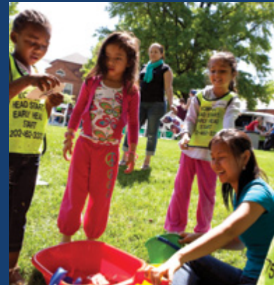
One hundred GW students hosted Jump Start for a Day in May, bringing more than 300 D.C. preschool children from low-income families to the Mount Vernon Campus for a day of fun-filled activities.