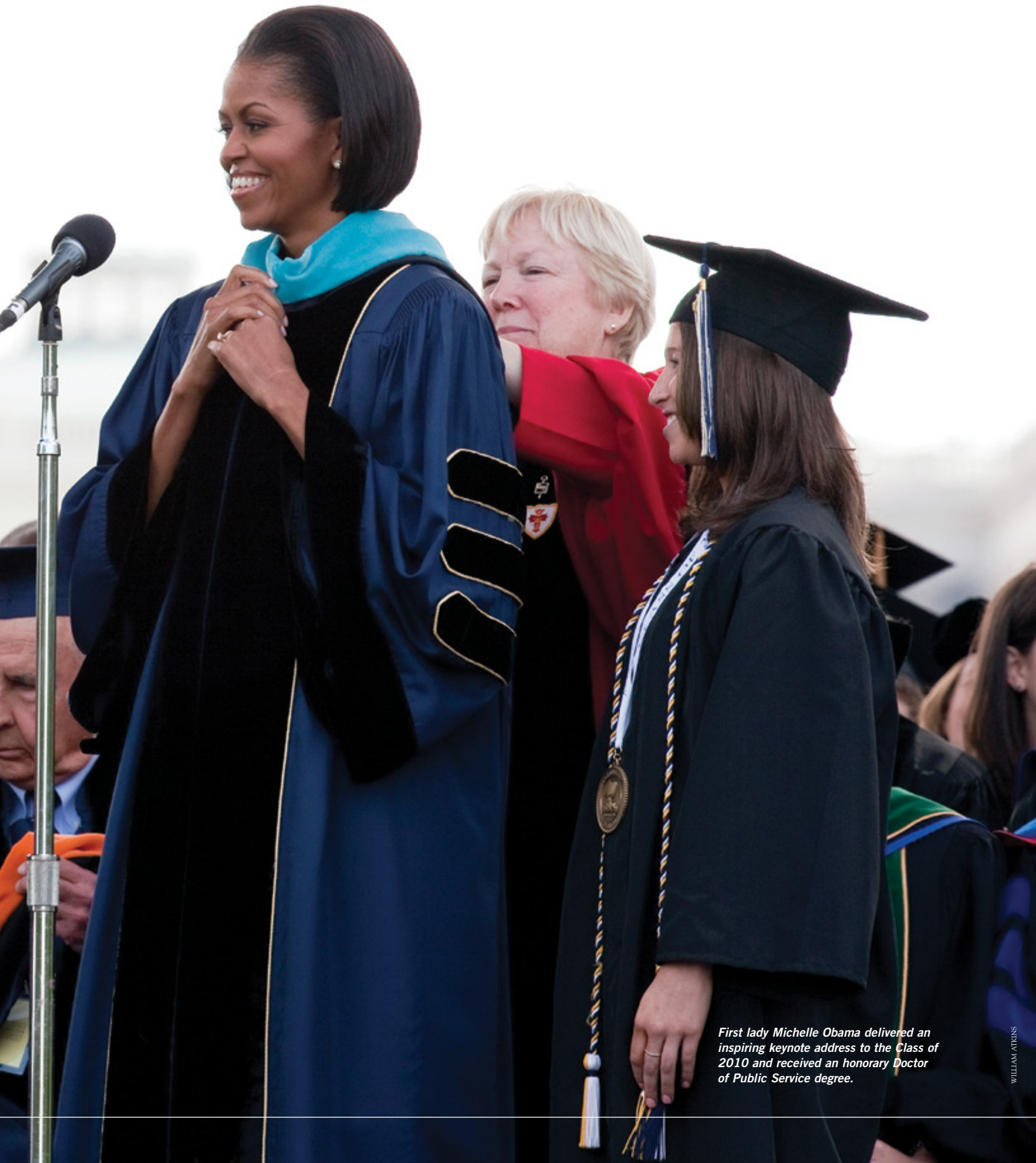
First lady Michelle Obama delivered an inspiring keynote address to the Class of 2010 and received an honorary Doctor of Public Service degree.