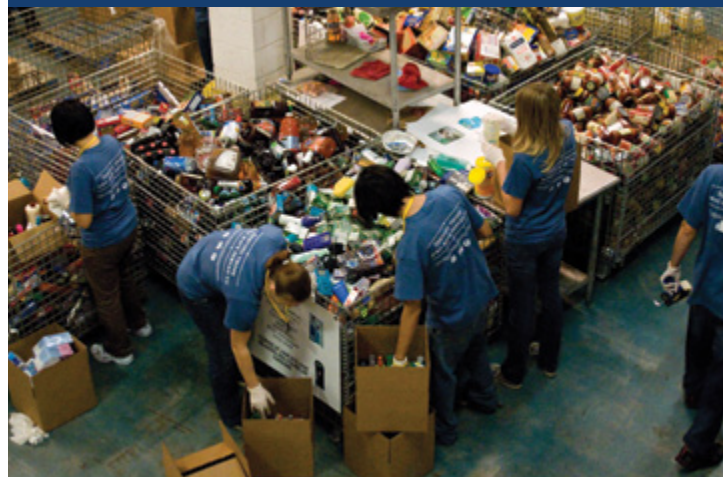
Freshmen came out in force to sort food at the Capital Area Food Bank and perform myriad other projects throughout Washington during the Freshman Day of Service Sept. 11, kicking off a year of service that culminated in Michelle Obama’s commencement speech.

The highest number of community service hours was logged through DC Reads—with 432 GW students racking up 29,574 hours