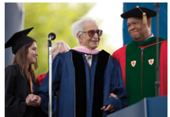
Legendary jazz pianist and composer Dave Brubeck received an honorary Doctor of Music degree at the ceremony.