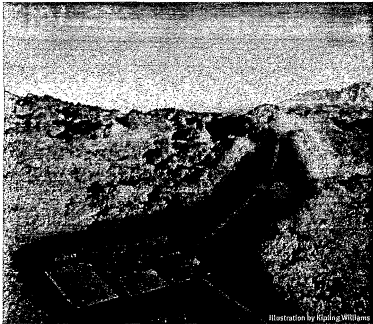
The key to defeating hardened and deeply buried targets is multi-intelligence collaboration. The NGA element embedded with the UFAC provides dedicated geospatial intelligence on site.

The NGA element embedded with the UFAC provides dedicated on-site GEOINT, including searching for, assessing, and monitoring undergrounds. Two branches at NGA also provide key analysis to the underground issue. Each branch has a complementary approach to the daunting task of analyzing undergrounds. Other NGA elements contribute to the UFAC via collection, data integration, broad-area search programs, the development and evaluation of tools and methodologies, and reach-back to the functional and regional offices. The geologists, geospatial analysts, imagery analysts and imagery scientists work together to help the UFAC satisfy its many customers.