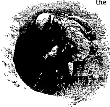
A soldier investigates an underground facility in Afghanistan.

NGA plays a key role in this effort by applying many of its primary tradecrafts to the task at hand. As one might expect, geospatial intelligence is one of the most important elements of analysis, especially High Resolution Terrain Information (HRTI) data. In addition, through Defense Intelligence Agency Web pages, applicable maps, related site diagrams, and related imagery are but a mouse click away. But at the heart of NGA's participation is detailed and tailored analysis. Such analysis paves the way for operational uses, including targeting decisions, for intelligence officers and operational forces around the world.