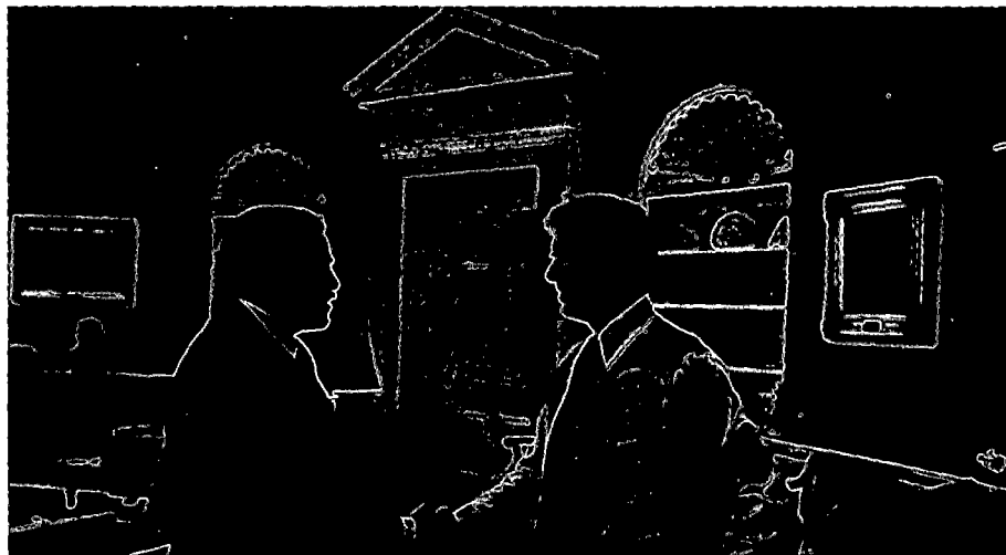
President Jimmy Carter expresses his appreciation to author for his key role in the exfiltration operation.

I showed the President some of the cover materials used in the operation and told him the Argo/Argau story. Because of some indecision about whether the White House photographer should take my picture shaking