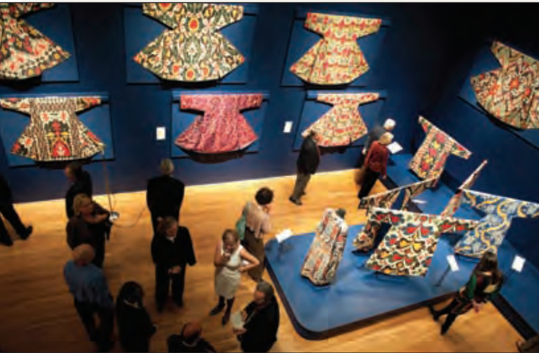
The Textile Museum's special exhibit, "Colors of the Oasis: Central Asian Ikat," will be traveling to art museums in Seattle and Houston.

new creations will be displayed in the exhibition alongside the historic textiles that sparked their imagination.